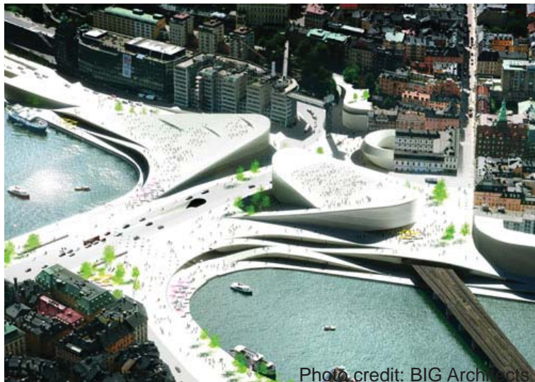
The design by BIG Architects was a strong entry but was not chosen because of its tabula rasa approach to the site. It did not mesh with the existing style of this part of the city.

The design by Foster + Partners was chosed because it proposed several small-scale spaces such as the one pictured above, in order to harness the energy from surrounding areas.