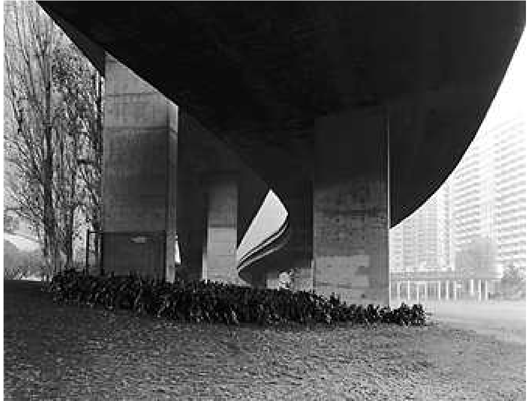
(above, left) photo of Embarcadero Center West, designed while the elevated freeway still stood. Architect: John Portman -www.portmanusa.com