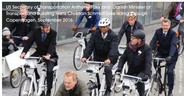
US Secretary of Transportation Anthony Foxx and Danish Minister of Transport and Building Hans Christian Schmidt bike riding through Copenhagen, September 2016