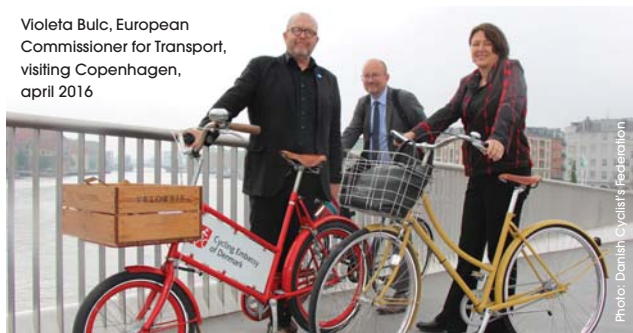
Violeta Bulc, European Commissioner for Transport, visiting Copenhagen, april 2016