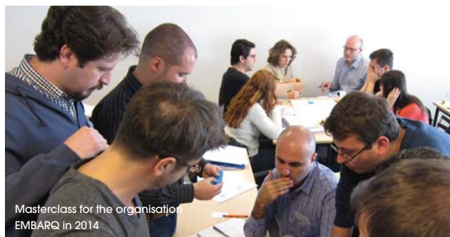
Masterclass for the organisation EMBARQ in 2014

Our masterclass combines presentations, hands-on workshops and site visits. By incorporating participants' local challenges into the mix, the masterclass inspires and prepares participants to develop or strengthen cycling in their own cities.