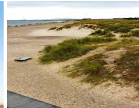
The design was inspired by the natural sand dunes.

Copenhagen's harbor area has been widely criticized through the years for being the site of flawed infrastructure and unusable public spaces. The City Dune, an urban space designed by SLA and inspired by the texture and form of the sand dunes on the coast of north Jutland, is an urban gesture that bonds the SEB Bank building together with the traffic-heavy crossroad, the harbor front, and the rest of the Danish capital. This pattern of undulating hard and green surfaces transforms the urban monoculture of offices and roads to an environment for the people.