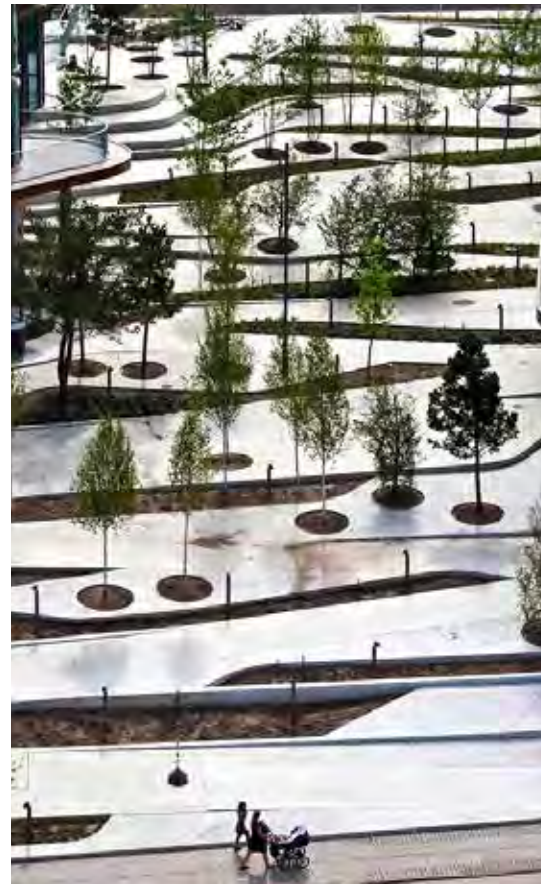
A path zigzags up from Baernstorffsgade street.

Although the City Dune is a privately-owned property of SEB, the site must remain open to the public according to Danish laws. The City Dune is successful in making the entire complex a pleasant and accessible place in the city.