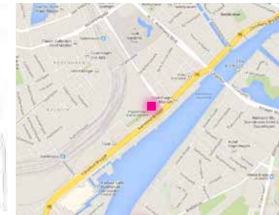
■ SITE: Copenhagen Harbor