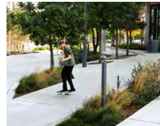
...and a skateboarding paradise in Copenhagen.