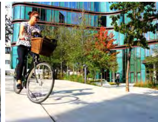
The City Dune is a cycling path...