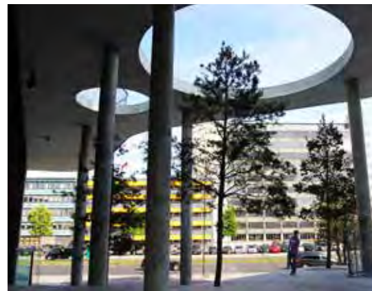
Vertical relationship of open spaces.