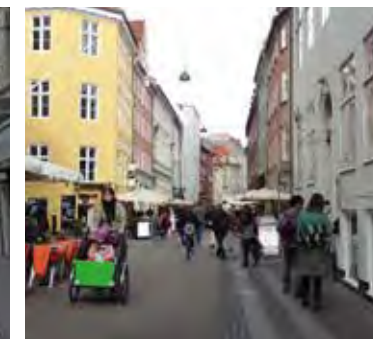
8,000 pedestrians / day benches & cafe seating: 372 Average number of people present: 258