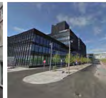
8,000 pedestrians / day benches & cafe seating: 0 Average number of people present: 19