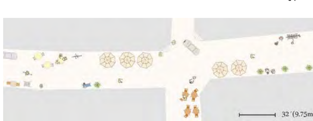
Street use mapping