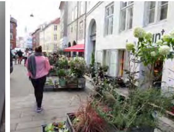
What is a good indicator of the quality of a space?