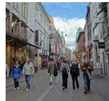
85,000 pedestrians / day