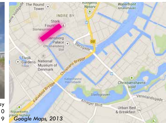
■ SITE: Strædet, Copenhagen, Denmark