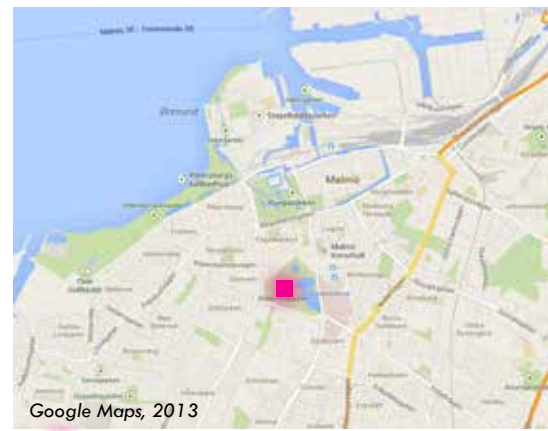
Google Maps, 2013

Nestled in the southern corner of Malmö’s historic Pildammsparken sits the otherworldly Pildammsteatern. The materials are simple: tiered seating and a circular stage of paving stones and a backdrop of rolling, 20'+ tall turf covered mounds. When empty, as our studio discovered it in September 2013, the site invites exploration and play. In this context, it’s difficult to not be reminded of the Baggins’ countryside in Tolkein’s works.