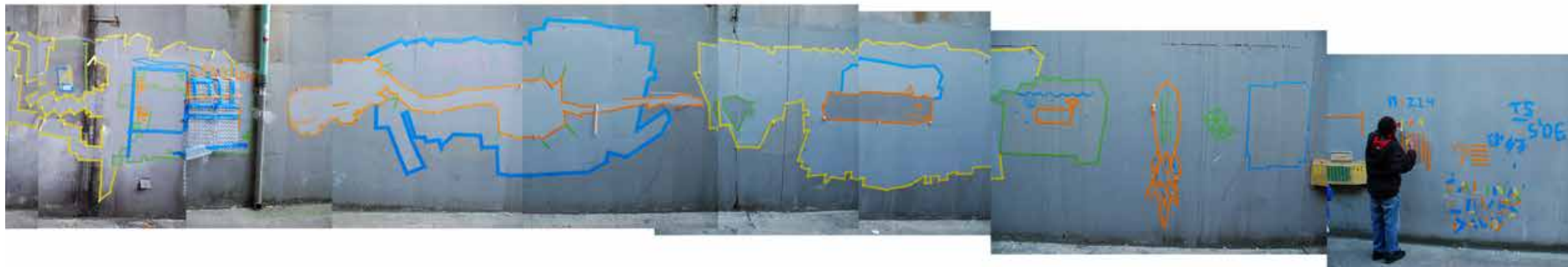
Post intervention - the installations continue