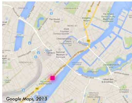
Google Maps, 2013

The bold, unique design of this boardwalk extension was conceived and built with the express intent of reclaiming access to the harbour and connecting the overall urban fabric with the waterfront. The existing buildings along the Kalvebod Brygge dominate the edge and create large, uninviting shadows. The double-wave form of the Kavelbod Bølge reaches beyond these shadows and invites visitors and residents to relax, play, and stay.