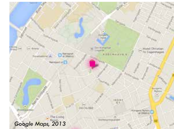
Google Maps, 2013

There is a lack of open space in the University District, places where children can play freely, and the area will only get denser with the opening of the light rail. One possible remedy could be to design facilities that serve multiple purposes, addressing both urban infrastructure and open space needs.