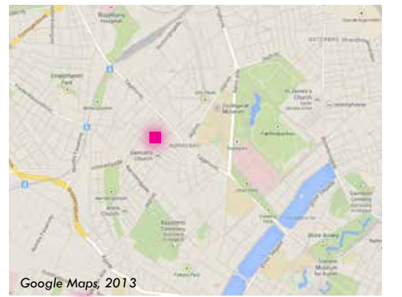
Google Maps, 2013